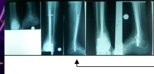
Charcot joint treated successfully with SIGN IM nail

Computer simulations as well as tactile sense guide placement of fixation devices. Surgeons use whatever technology is available to treat fractures. As technology advances in the United States, SIGN surgeons still use their sense of feel to place SIGN nails in tibias, femurs, humerus and ankles.